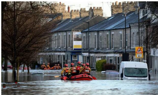
▲ Flooding in York.

Government's official climate advisers say there is no proper preparation to cope with heatwaves and flash floods